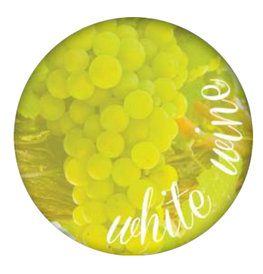
LIT DOME MEDALLION