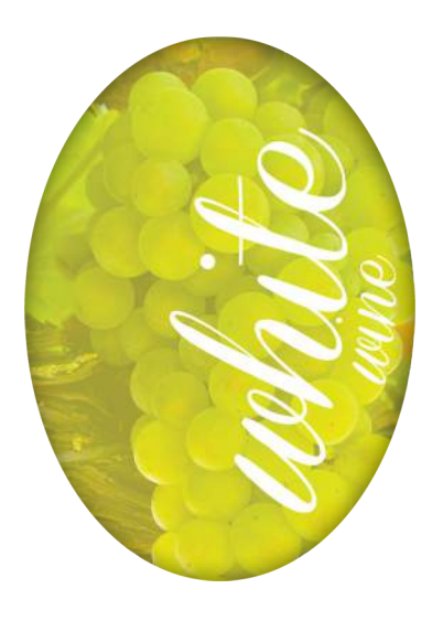
LARGE OVAL MEDALLION